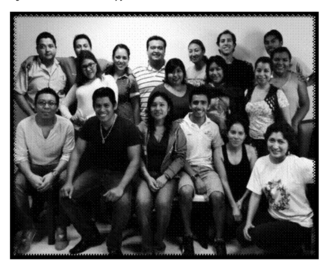
Figure 4: The General Assembly for GOJoven Mexico 2013